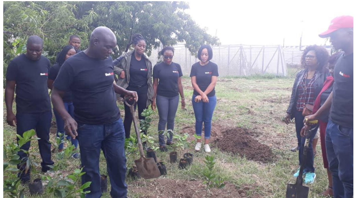
Blackshark Team on tree planting day