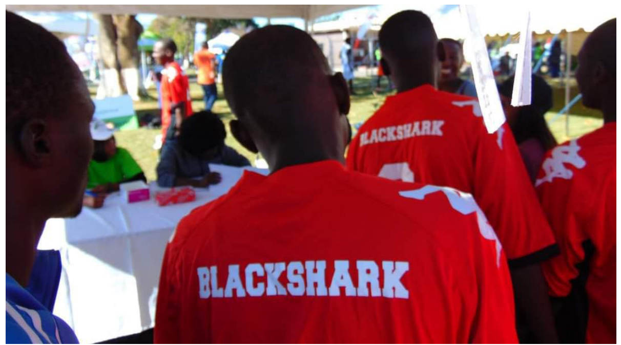
Blackshark Wellness Day