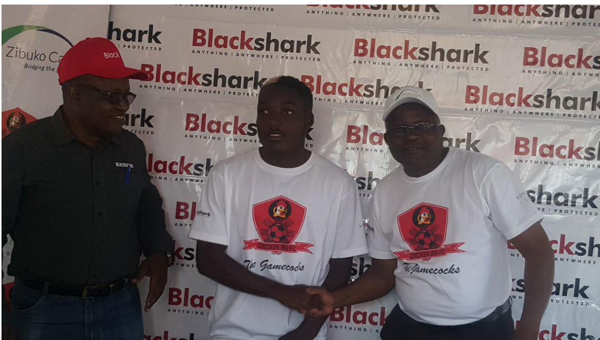
Chicken Inn Football Club