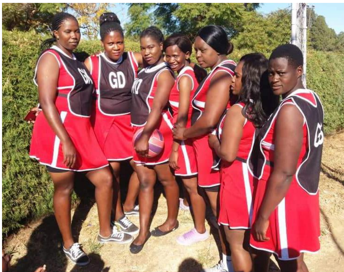
Blackshark Netball Team