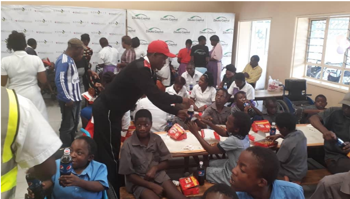
Jairos Jiri Christmas party hosted by Blackshark 2019