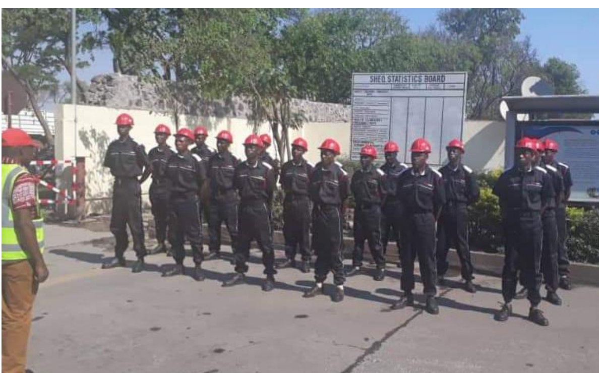
Blackshark Mine Security Team