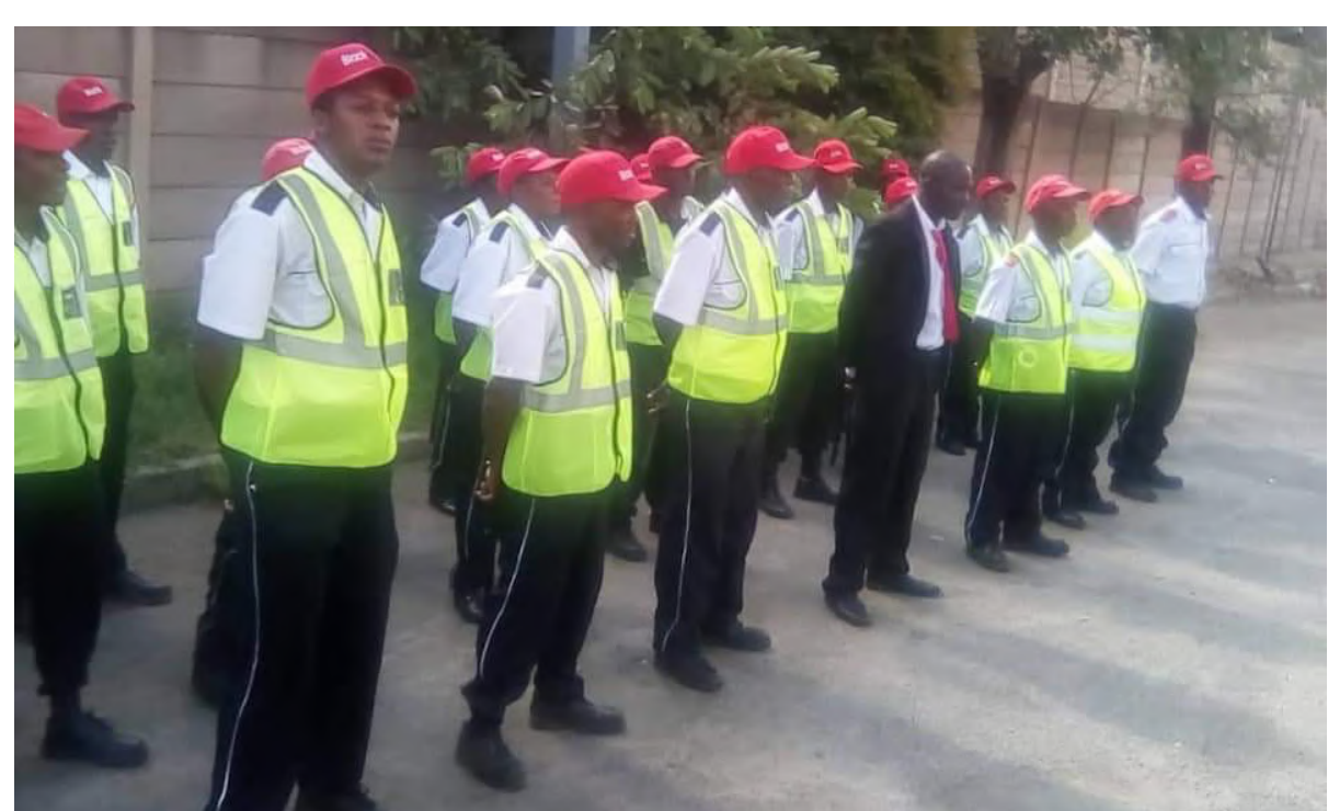
Blackshark Mine Security Team